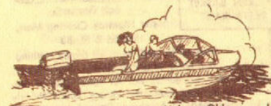
Lake Overholser Near Yukon, Okla.