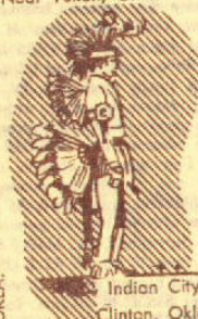
Indian City Clinton, Okla.