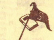
Southwestern State College Weatherford, Okla.