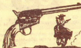
Jesse James Hideout, Meramec Caverns Stanton, Mo.