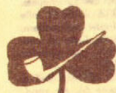
Annual St. Patrick's Day Celebration Shamrock, Texas