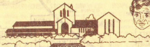
Will Rogers Memorial, Museum and Tomb Claremore, Okla.