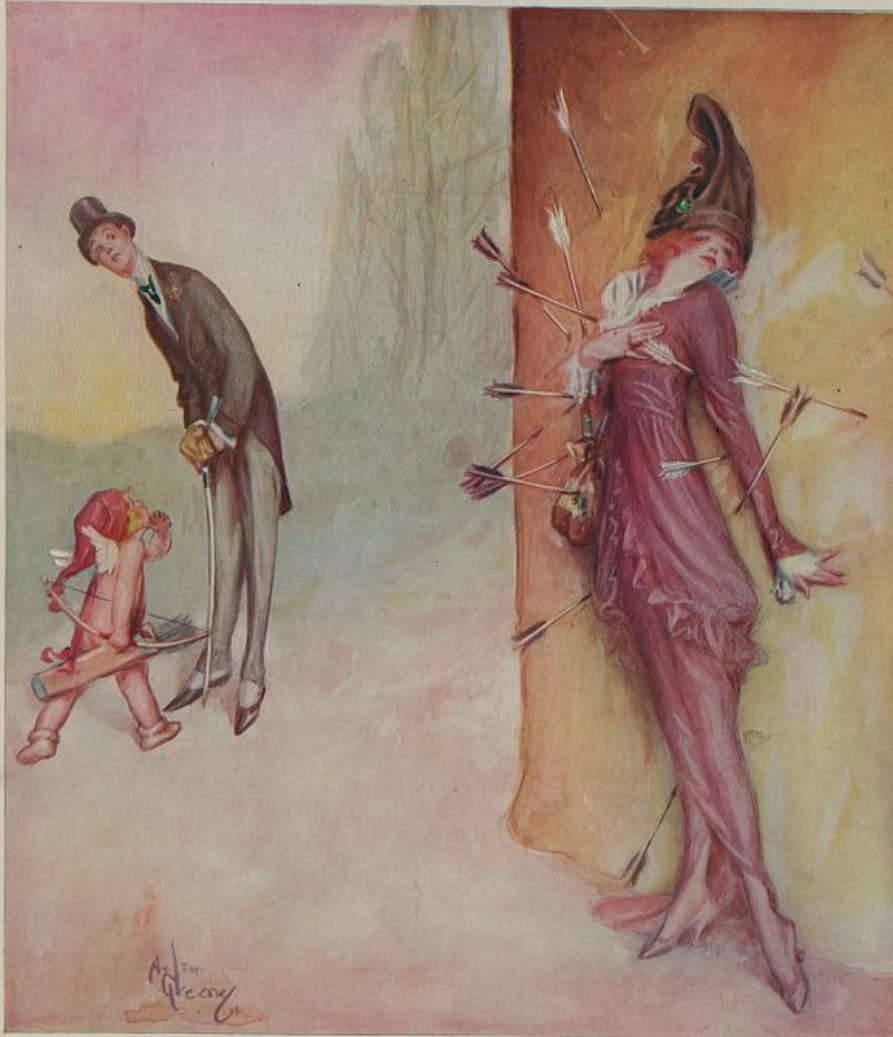
THE NARROWING TARGET.

CUPID.—I'm doing the best I can, old man, but if I make one hit in twenty these days I'm lucky.