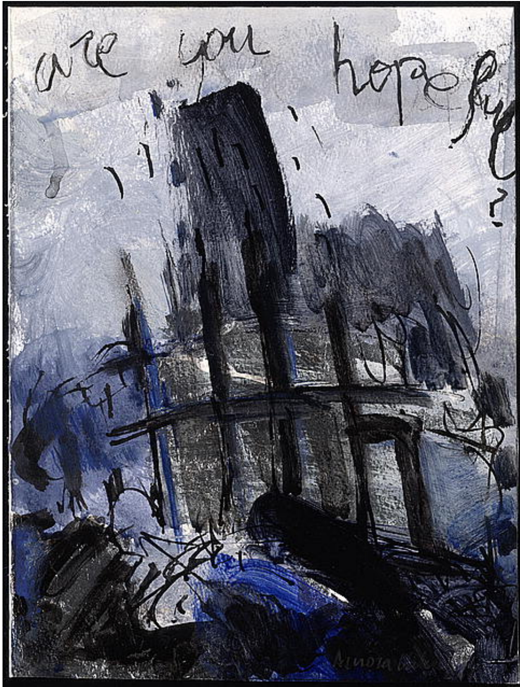
Are you hopeful? / Aurora Valero