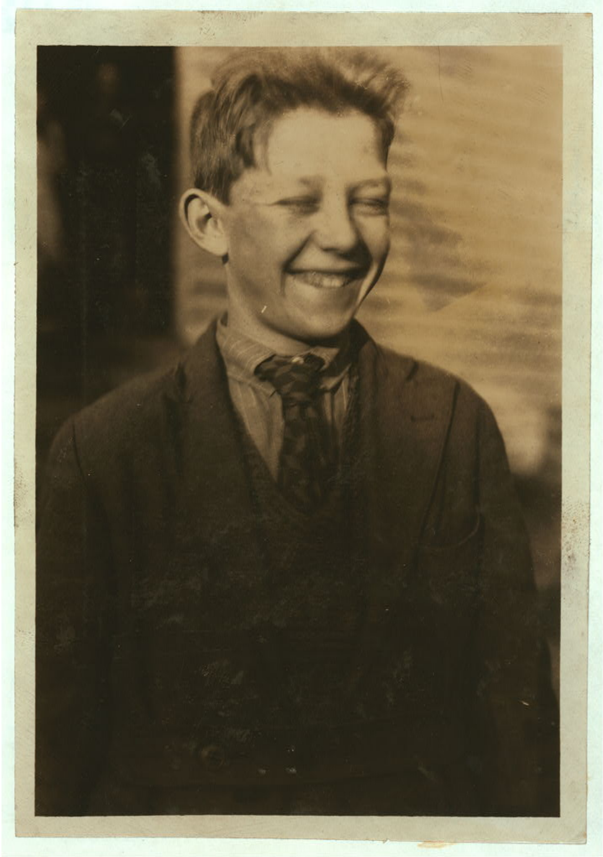
The first day at school - one of the Pocahontas Co. rural schools. Location: Pocahontas County, West Virginia

http://www.loc.gov/pictures/item/ncl2004005121/PP/