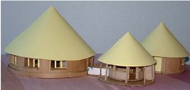
Architect's Model of a Lubuto Library in the Style of Traditional Zambian Homesteads: Entry (center), Activities Building (right), Library Reading Room (left)