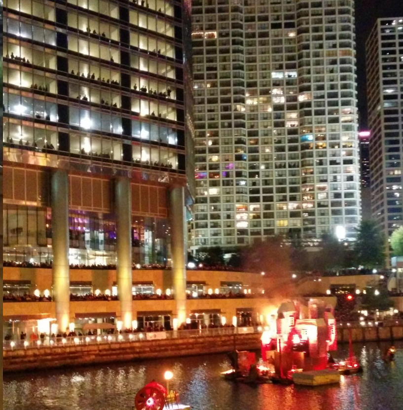
Different views of the GCFF's main spectacle, a floating set fashioned after some of the city's 19th century cityscape, show the progression as it burned atop the river. Despite some setbacks due to the inclement weather leading up to the event, the 30,000 plus crowd still cheered on as the flames engulfed the spectacle.